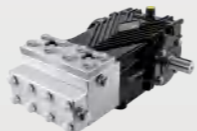
Stainless Steel Pump