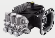
Nickel Plated Brass Pump