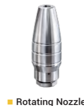
■ Rotating Nozzle