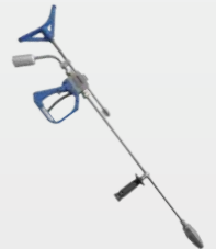
Dump Gun with Rotating Nozzle