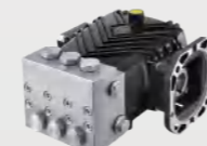
Stainless Steel Pump