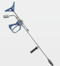
Dump Gun with Rotating Nozzle