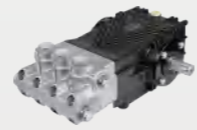
Nickel Plated Brass Pump