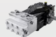
Stainless Steel Pump