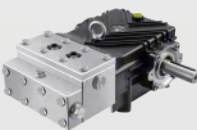
Stainless Steel Pump