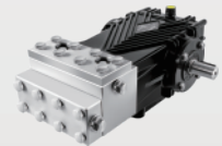
Stainless Steel Pump