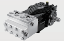
Stainless Steel Pump