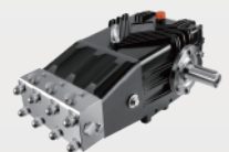
Stainless Steel Pump