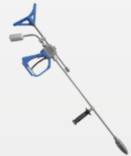
Dump Gun with Rotating Nozzle