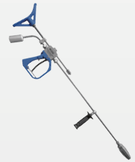
Dump Gun with Rotating Nozzle

Large-capacity stainless steel water tank with internal float valve prevents pump damage from dry running.