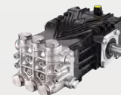
Nickel Plated Brass Pump