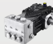
Stainless Steel Pump