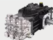
Nickel Plated Brass Pump