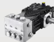
Stainless Steel Pump